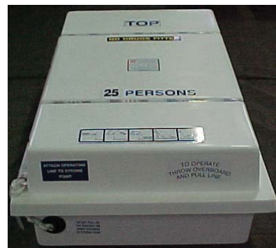
12 - 25 Person Container Top View