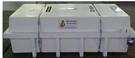
12 - 25 Person Container Side View