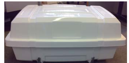
4 - 10 Person Container